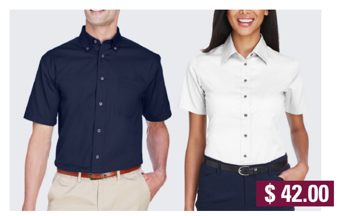
Harriton Easy Blend Twill Short Sleeve Woven 4.6-oz 55/45 cotton/polyester woven twill. Men's version has a left chest pocket. Stain-release, wrinkle-resistant.

(pictured right), Navy. Minimum Order: 15