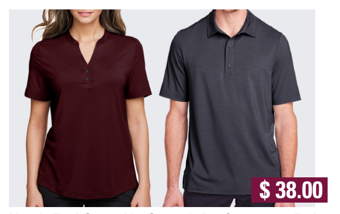
North End Snap-Up Stretch Performance Polo 5.3-oz 69% polyester, 26% lyocell, 5% spandex jersey. Metal three-snap closure, side vents.

Imprint: Full-colour McMaster logo embroidery, in one location (no larger than 4x4").