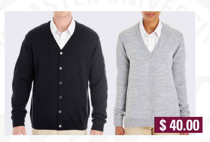
Harriton V-Neck Button Cardigan Sweater 11.8-oz, 100% acrylic jersey knit with Pilbloc™ anti-pill performance. Dyed to match buttons.

Imprint: Full-colour McMaster logo embroidery, in one location (no larger than 4x4").